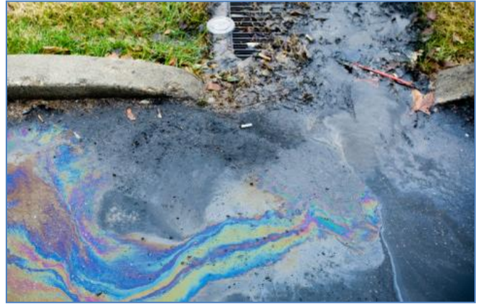
Millers River Watershed Council