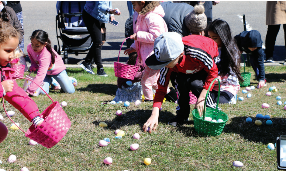
Children try to pick up as many eggs as possible during the Easter Egg Hunt.

More than 500 people celebrated Easter a little early at Islandia Village Hall as they attended the Easter Egg Hunt, which took place on April 2. Children scampered across the grounds of Village Hall to collect some of the 8,000 eggs that were available; many of the eggs contained a ticket in which the lucky children were able to redeem for a special prize. They also enjoyed hot cocoa, coffee, tea and cookies, danced to the music performed by “Joe the Singing Bus Driver” and had their pictures taken with the Easter Bunny.