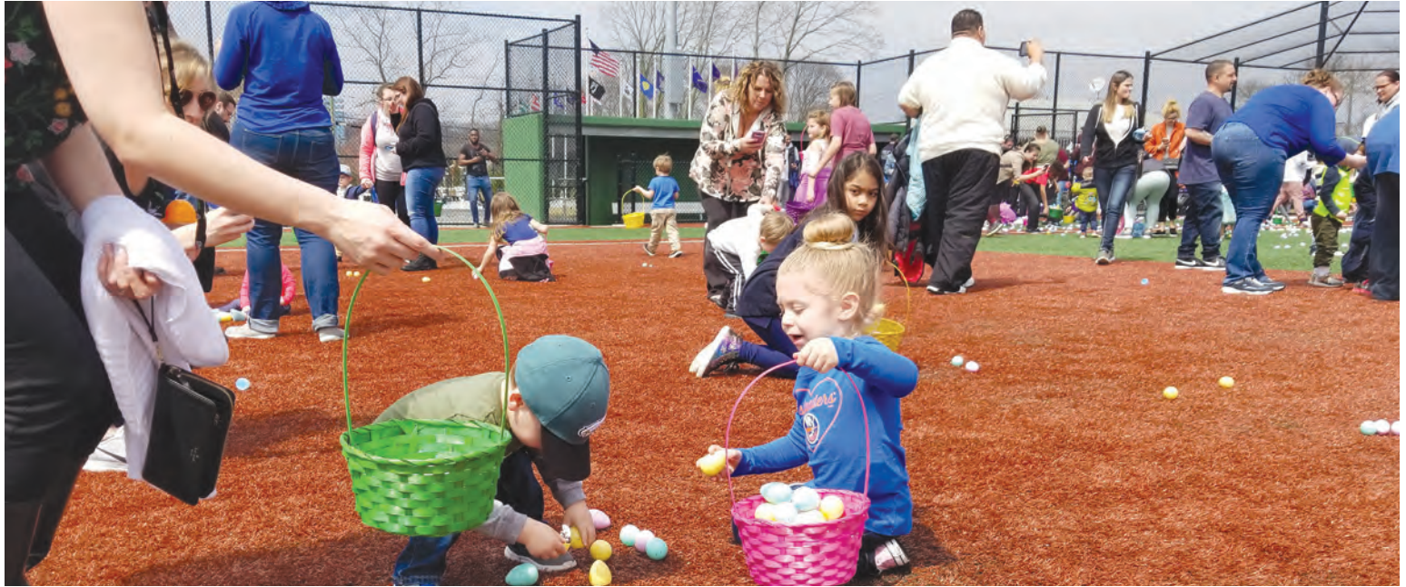
Children collect eggs at the Village of Islandia's 14th Annual Easter Egg Hunt.