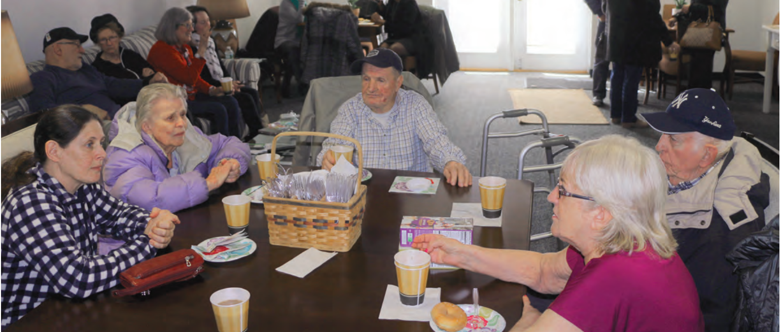
Residents enjoy refreshments and conversation during the grand opening of the Islandia Senior Center.