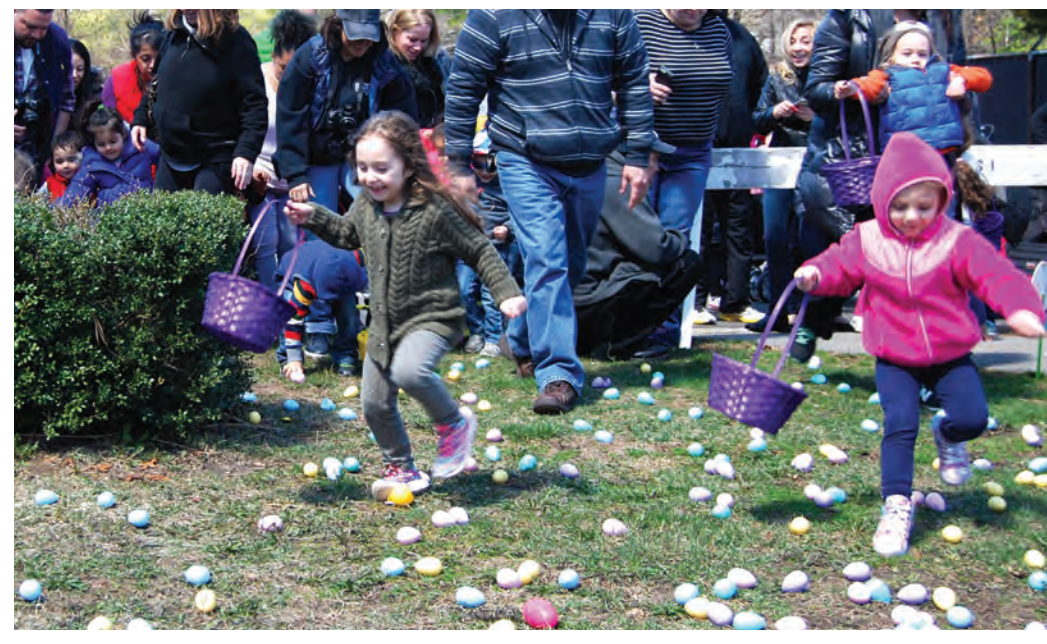
Children run out to collect some of the 8,000 Easter eggs that were laid out on the grounds of Village Hall during Islandia Village's 12th Annual Easter Egg Hunt.

Local families celebrated Easter a little early at Islandia Village Hall as they attended the 12th Annual Easter Egg Hunt, which took place on April 8. Children scampered across the grounds of Village Hall to collect some of the 8,000 eggs that were available; many of these eggs contained a ticket in which the lucky children were able to redeem for a special prize. They also enjoyed hot cocoa, coffee, tea and cookies, danced to the music performed by "Joe the Singing Bus Driver" and had their pictures taken with the Easter Bunny.