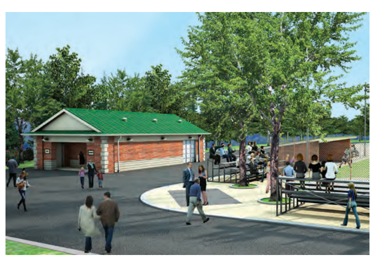
Artist's rendering of the First Responders Recreational Ball Field.

On June 7, Mayor Dorman joined village trustees, local elected officials and representatives of Delaware North, Bolla Market and Breslin Realty in the groundbreaking of the First Responders Recreational Ball Field.