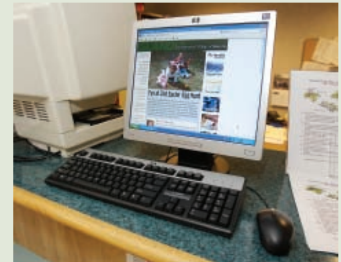
A computer at Village Hall allows residents to check codes.

minimal cost to participating residents.