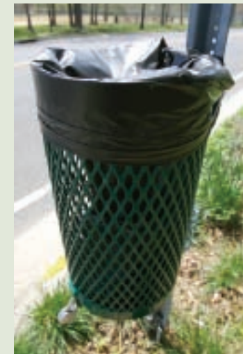
The Community Garden, the speed sentry on Old Nichols Road, and garbage baskets at bus stops have helped improve Islandia.

joyment of our residents, and the handicap accessories installed in the garden at no cost to the Village, thanks to a donation from the Town of Islip. » The alteration of the flight path of Computer Associates' corporate helicopter, which now arrives and departs the company's headquarters from the north, instead of along the previous southerly route, which took the aircraft across the village and directly over our heads.