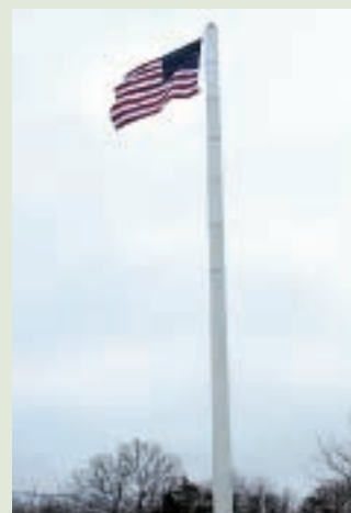
The Village Flag Pole serves as a revenue-producing cell tower.