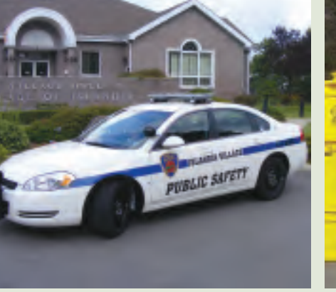
The DWI peddle carts are a favorite The new Code Car helps our Code Department patrol the streets of the Village, keeping the neighborhood safe for all Village residents.

» The alteration of the flight path of Computer Associates' corporate helicopter, which now arrives and departs the company's headquarters from the north, instead of along the previous southerly route, which took the aircraft across the village and directly over our heads.