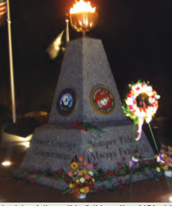
Pictured above is the new "Islandia Veterans Memorial Triangle" located at Johnson Avenue and Old Nichols Road.

» The updated Village Hall mailing system reduces the cost to 12 cents per mailing and the printing of our own envelopes to further cut costs.