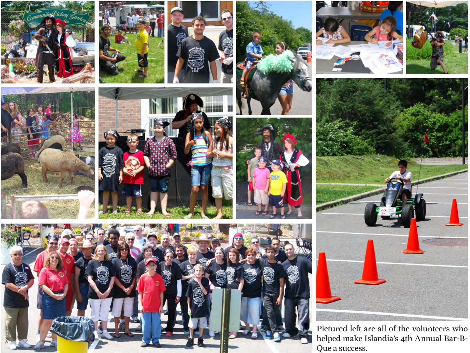
Pictured left are all of the volunteers who helped make Islandia's 4th Annual Bar-B-Que a success.