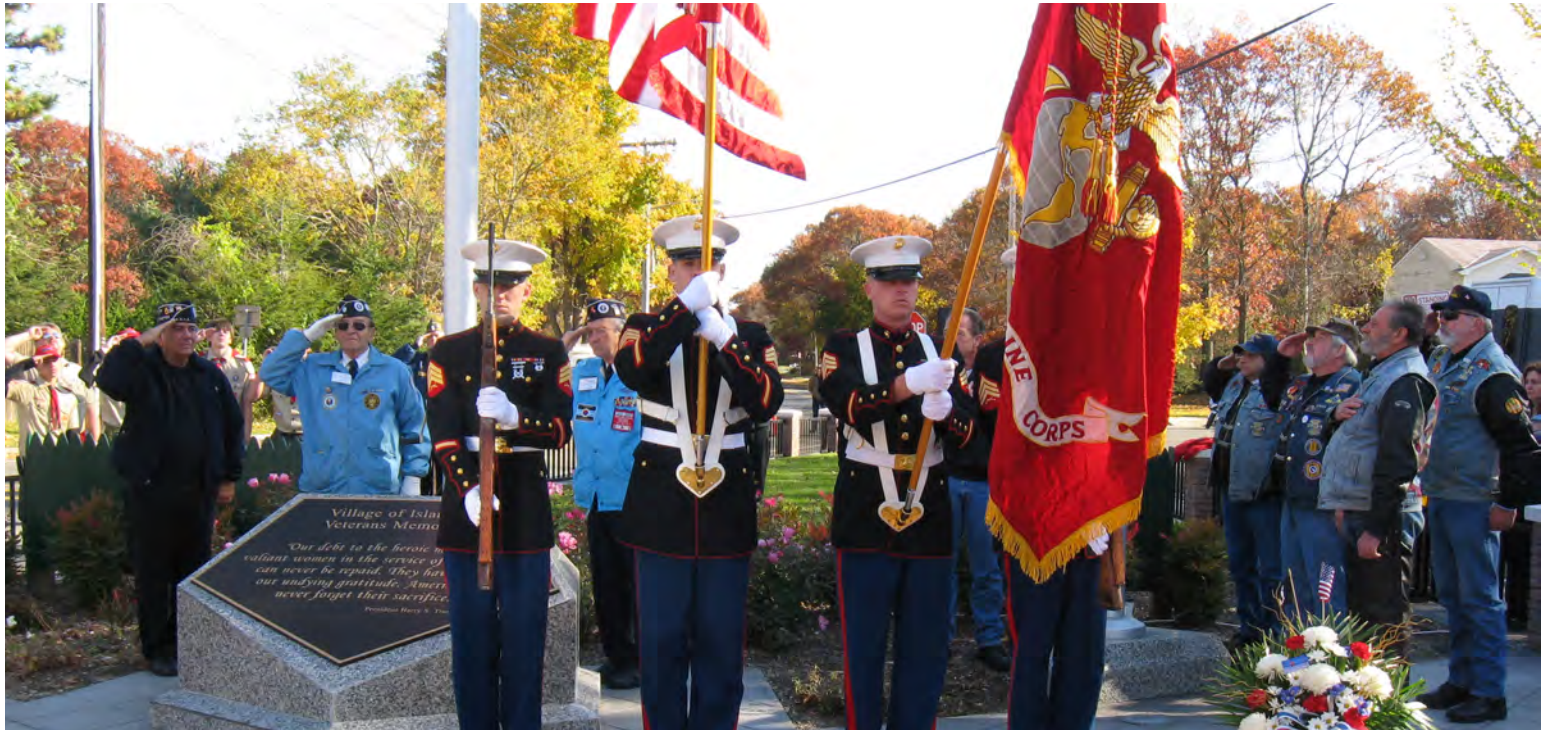
Islandia Village honors those who served in front of the Islandia Village War Veterans Memorial. Shown are USMC Honor Guard, the Vietnam Veterans of America, the local Korean War Veterans, and Ronkonkoma Boy Scout Troop #272.