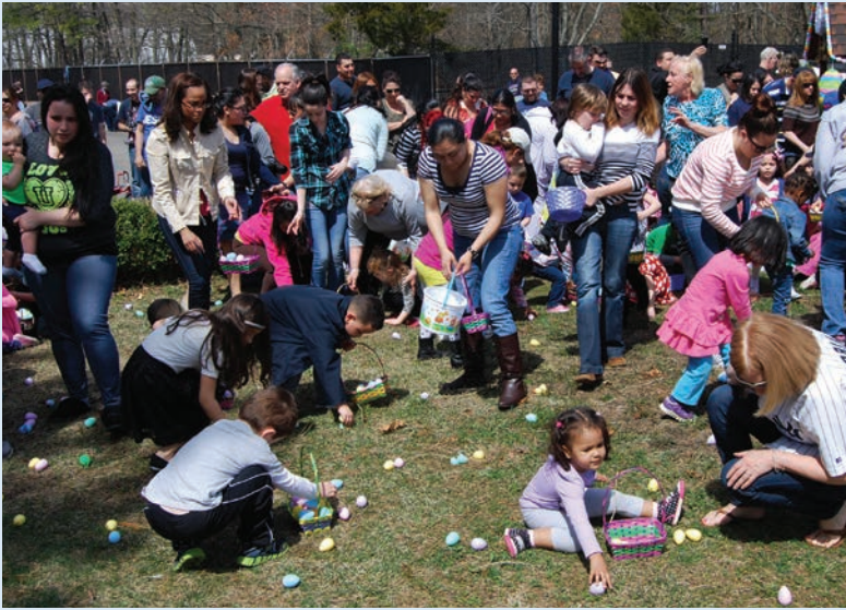
Parents watch their children collect Easter eggs at the Village of Islandia's 9th annual Easter Egg Hunt.