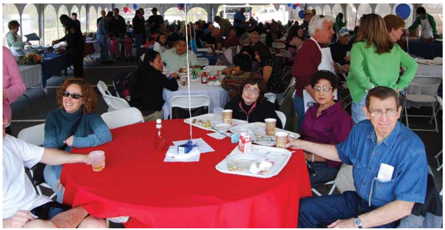
Islandia Village residents enjoy breakfast at the village's 25th anniversary celebration on April 11. Breakfast was served by village employees and members of Boy Scout Troop #272 of Ronkonkoma.

VOLUME 4, ISSUE 2 | OFFICIAL NEWSLETTER | SUMMER 2010