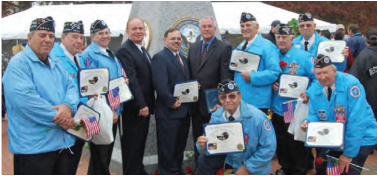
This year's Memorial Day observance is being held on Saturday, May 29, 2010 at the Veterans Memorial Triangle.

2005: $3 Million Debt —→ 2010: Debt Free 2009 Garbage Tax: $354 —→ 2010 Garbage Tax: $0