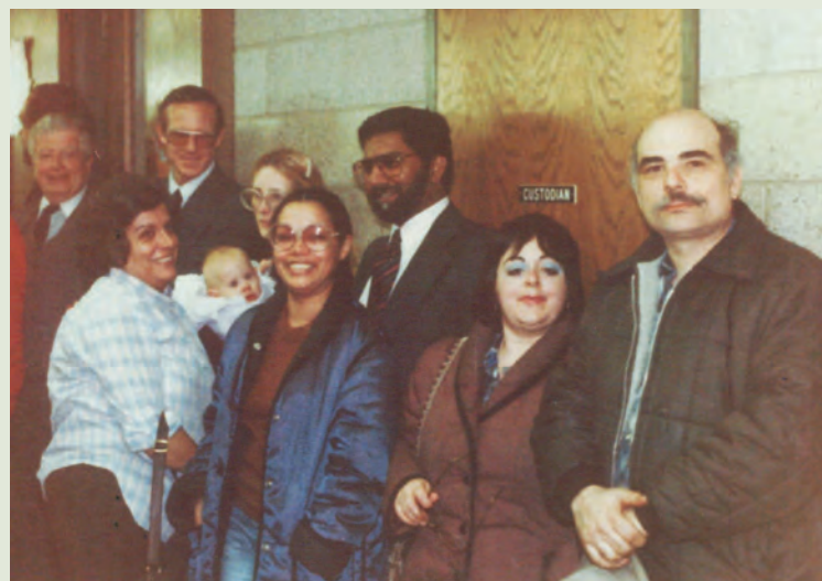
Voters line up at A.T. Morrow Elementary School on April 1, 1985 to cast their vote on a referendum to incorporate the Village of Islandia.