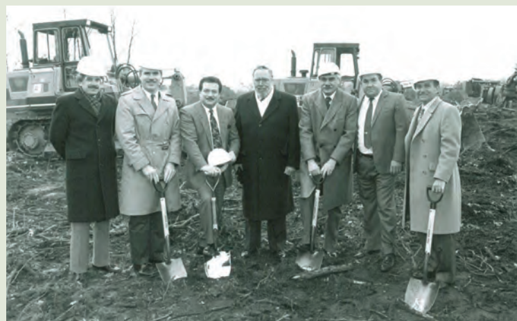
Groundbreaking ceremony for the Islandia Shopping Center, February 1990.