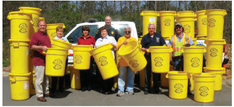
Pictured is Mayor Allan Dorman of the Village of Islandia along with employees who helped to distribute 1,600 recycling pails to Village of Islandia residents in the spring of 2008.