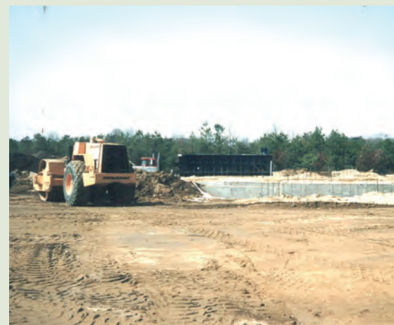
The clearing of the property to make way for the new village hall, March 1992.

The Village of Islandia is home to over 3,000 residents and over 1,300 businesses. It encompasses 2.25 square miles and contains 275 acres of Greenbelt, including Lakeland Park and Islandia Farm. The village is comprised of the Hauppauge, Central Islip and Connetquot School Districts; the Hauppauge, Central Islip and Ronkonkoma Postal Districts; and the Hauppauge, Central Islip and Lakeland Fire Districts.