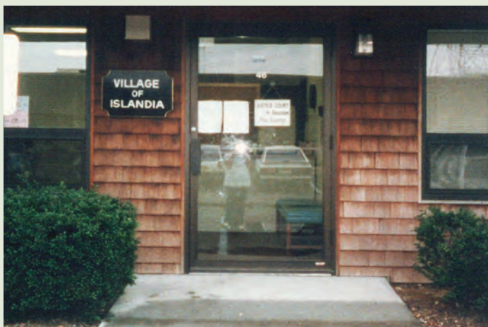
The first village hall was housed in the Crossroads Executive Center.