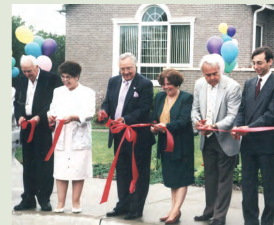
Ribbon cutting ceremony at Islandia Village Hall in June 1995.