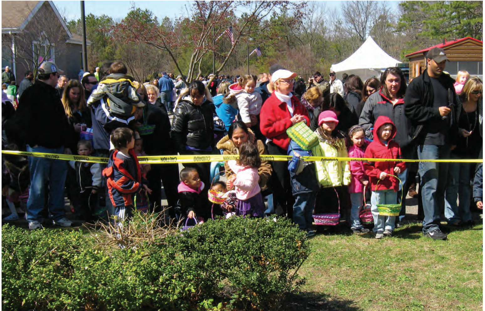
The Village of Islandia hosted the 5th Annual Easter Egg Hunt on March 27th. See more photos on page 3.

VOLUME 4, ISSUE 1 | OFFICIAL NEWSLETTER | SPRING 2010