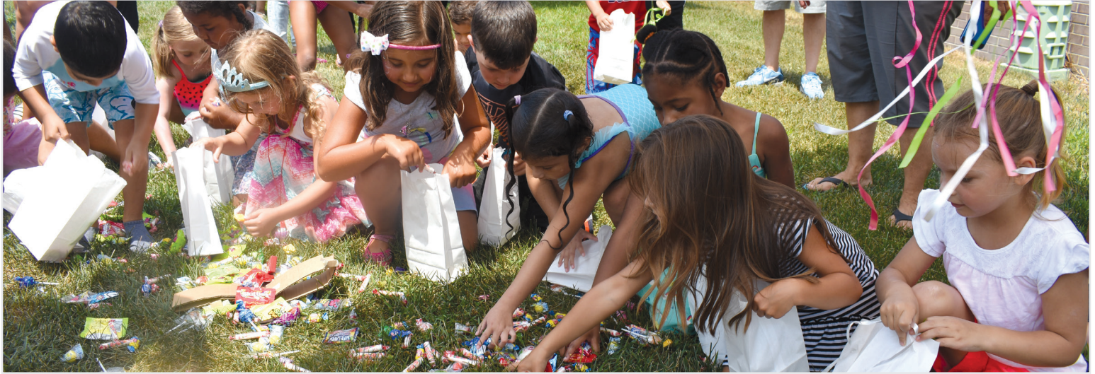
Children collect candy after breaking open the piñata at the Village of Islandia's 13th Annual Bar-B-Que.

Despite the heat and humidity outside, more than 800 Islandia Village residents came out to the thirteenth Annual Bar-B-Que on July 14. Children in attendance received a free baseball-themed gift pack containing a box of Cracker Jacks and an inflatable baseball. The theme was to commemorate the recent grand opening of First Responders Recreational Ball Field.