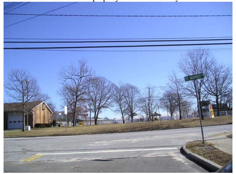
15. View from St. Marks Circle east towards subject property

13. View northeast towards property from Erhardt Way