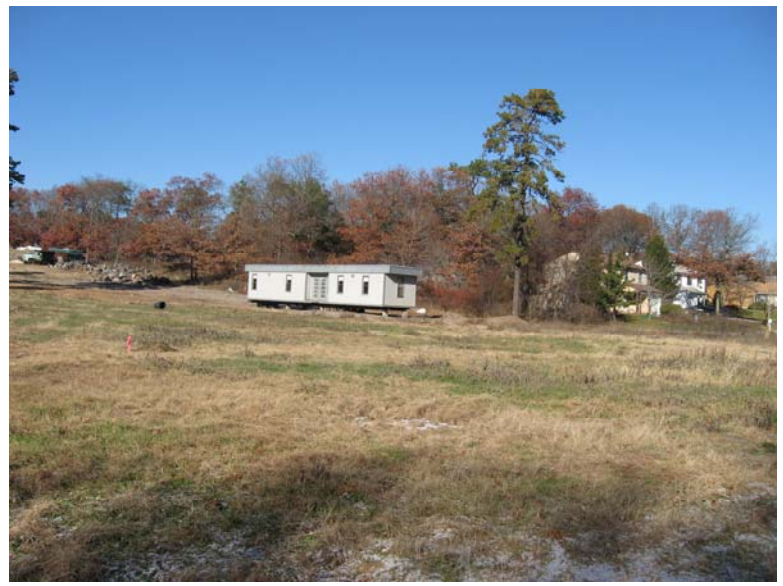
2. View from rear of property looking northeast towards Sampson Ave