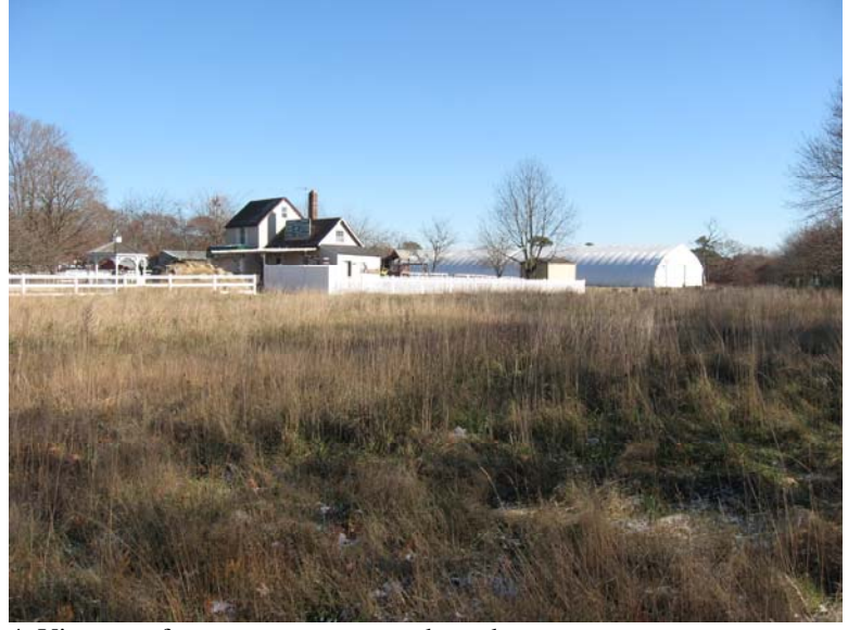
4. View east from western property boundary