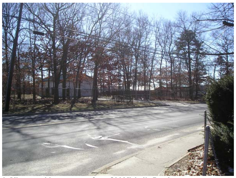
9. View to subject property from Old Nichol's Road