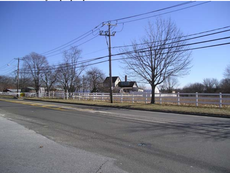
11. View east from Old Nichol's Road to subject property