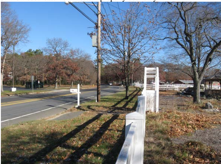
7. View north along property boundary

5. View southeast from western property boundary