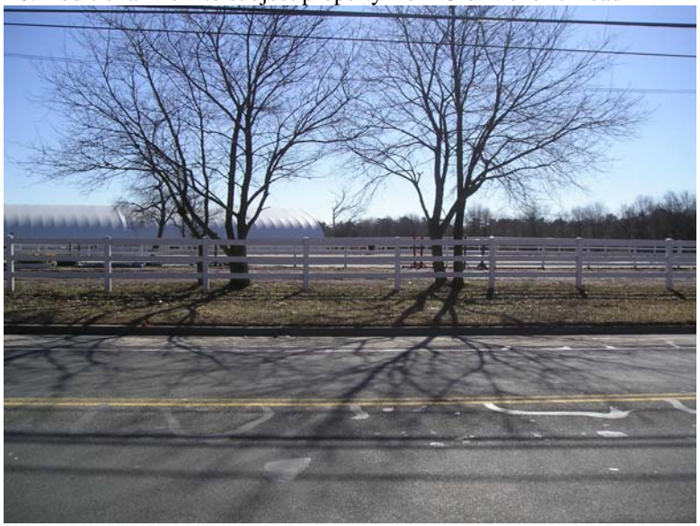
12. View to property from Central Islip Fire Department property