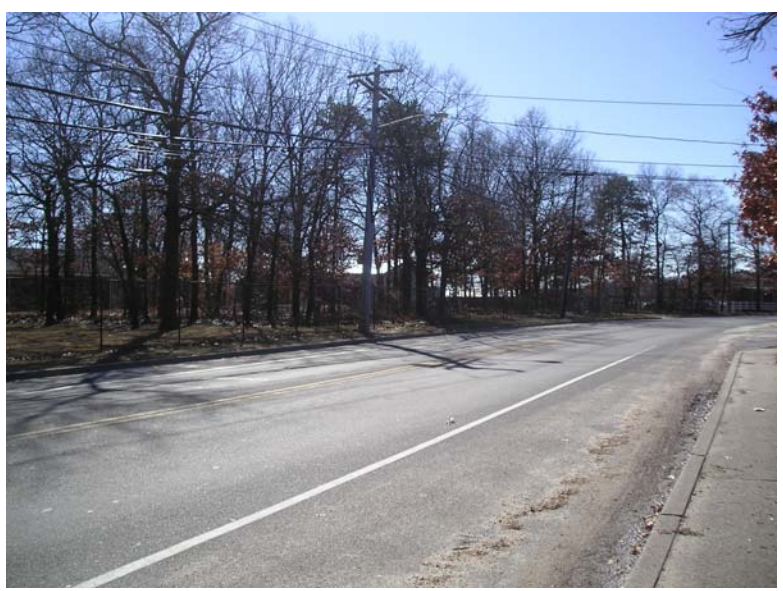
10. Additional view to subject property from Old Nichol's Road