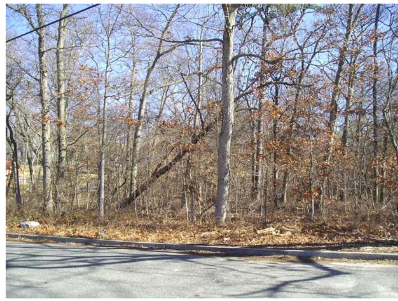
14. Additional view from Erhardt Way toward subject property