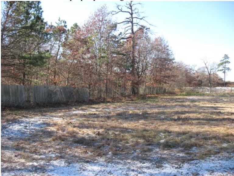
3. View toward western property boundary