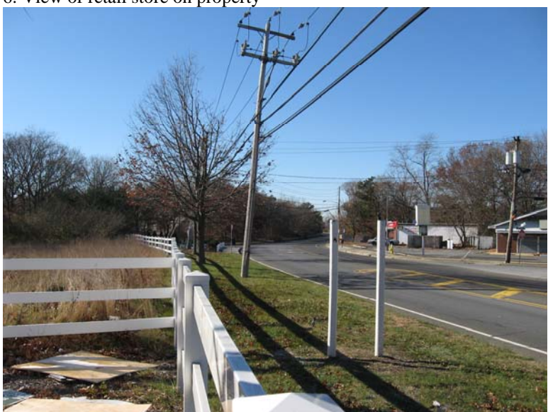
8. View south along property boundary