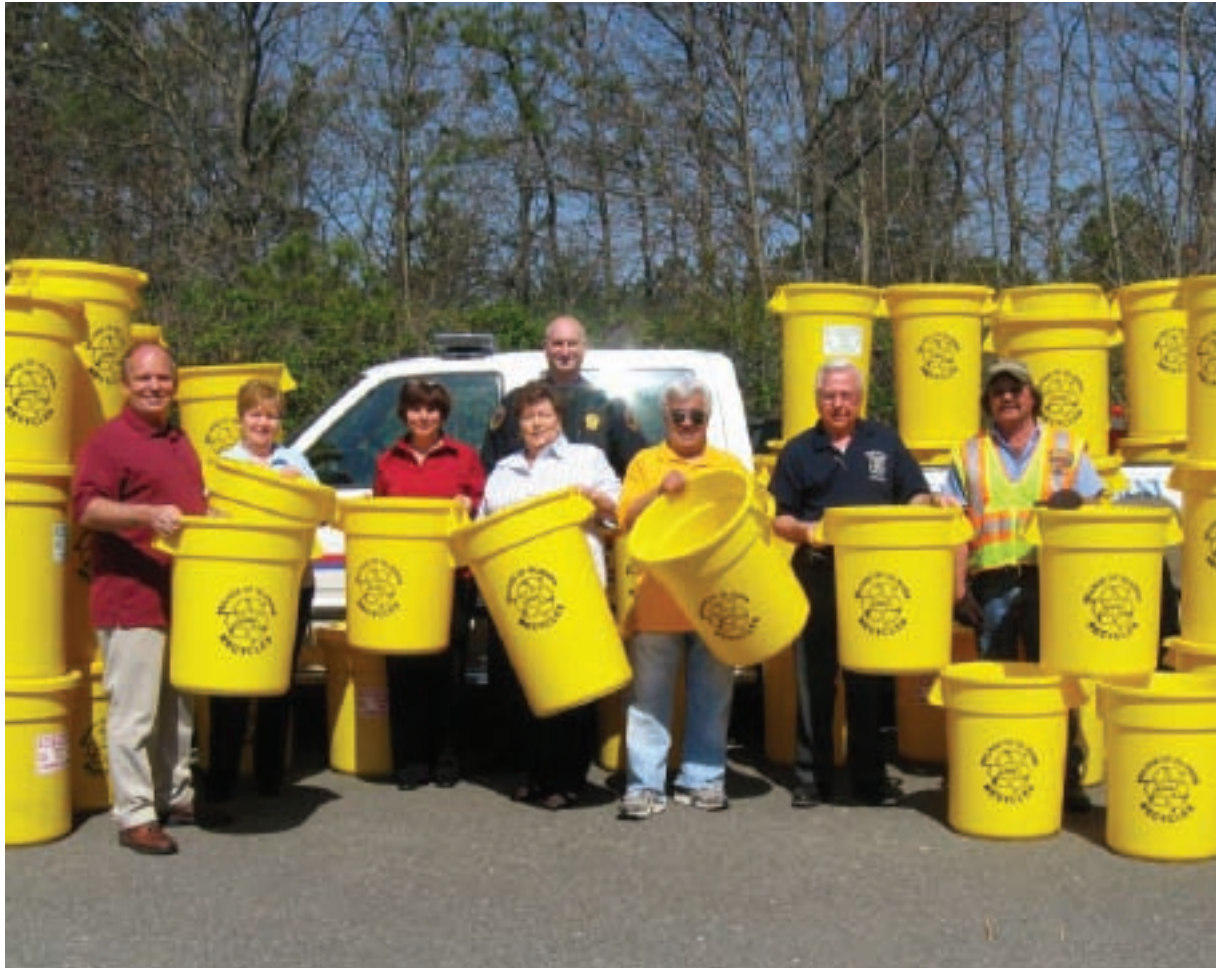
Pictured is Mayor Allan Dorman of the Village of Islandia along with employees who helped to distribute 1600 recycling pails to Village of Islandia residents.