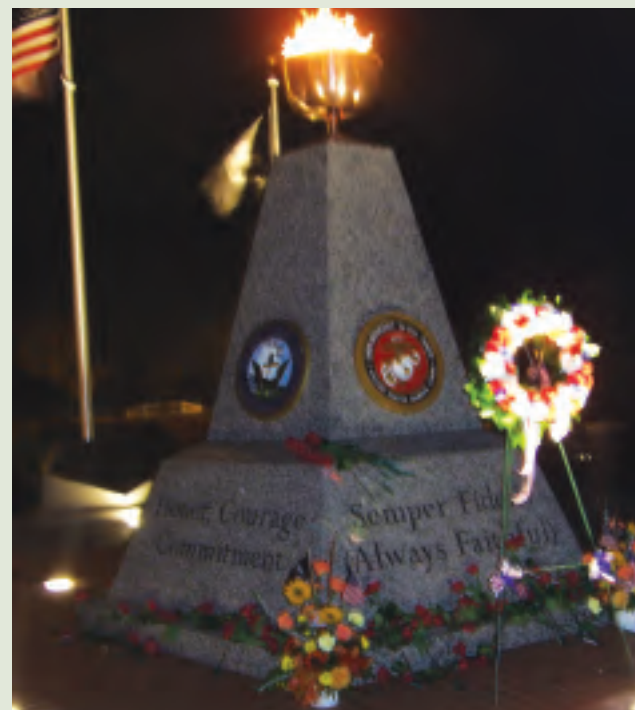
Pictured above is the new "Islandia Veterans Memorial Triangle" located at Johnson Avenue and Old Nichols Road.