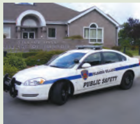
The new Code Car helps our Code Department patrol the streets of the Village, keeping the neighborhood safe for all Village residents.