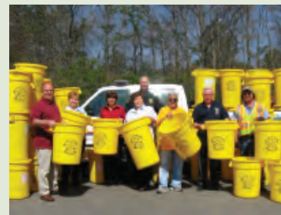
Islandia's new recycling program has brought in 4.5 tons of paper recyclables in each pickup for a monthly total of 9 tons. 2.34 tons of mixed recyclables (glass and plastic) have been collected each pickup for a monthly total of 5.68 tons.