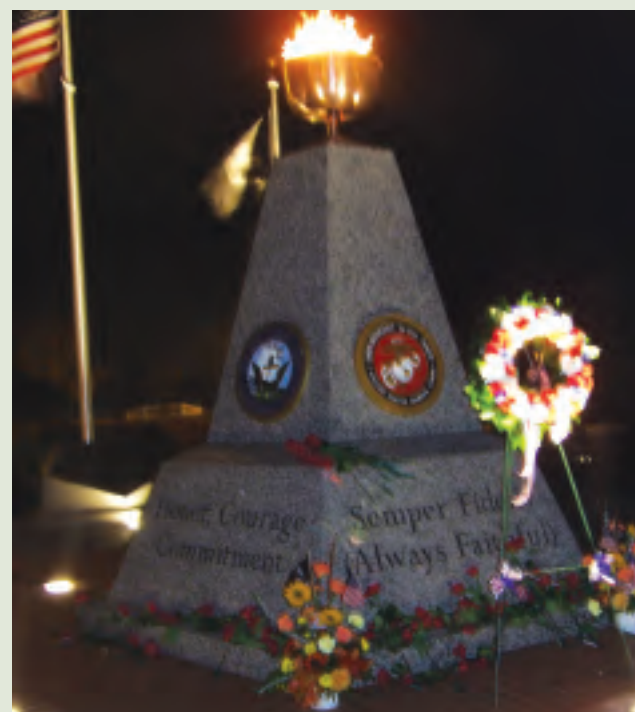
Pictured above is the new "Islandia Veterans Memorial Triangle" located at Johnson Avenue and Old Nichols Road.