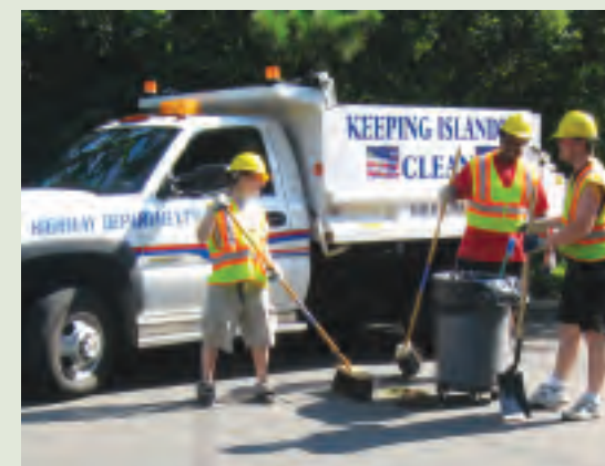
"Keep Islandia Clean" is a new program in the Village where residential streets are swept by the "Keep Islandia Clean Team." This program is in addition to the four street sweepings throughout the Village per year.