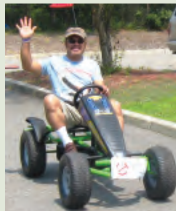
The DWI peddle carts are a favorite learning tool for our residents.